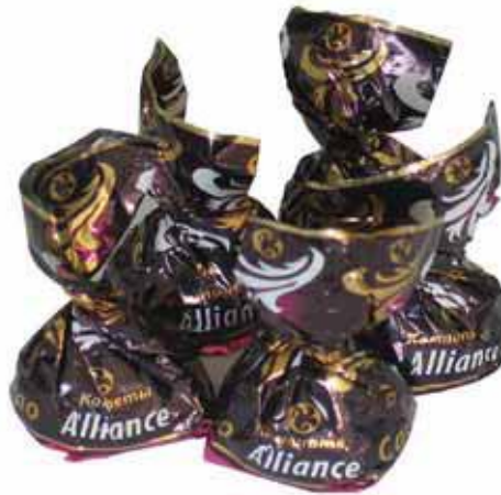
Chocolate Products wrapped in Top Twist by Theegarten-Pactec's machines

world. At Gulf Pack 2009, THEEGARTEN-PACTEC (Booth W602) will present the complete program of wrapping machine via an electronical catalog, including detailed information regarding the latest developments. For more information regarding THEEGARTEN-PACTEC please visit: www.theegarten-pactec.com