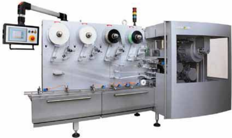
Medium speed continuous motion wrapping machine with belt feeding.

Cut & wrap technology has been and continues to be one of the THEEGARTEN-PACTEC domains. Extruded and Co - extruded Bubble gum, Chewing gum, Chewy candy, Soft gum, Toffee - with high or low fat